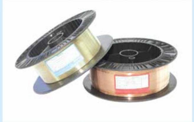
Brazing Wire in Plastic Spool